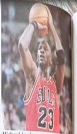
Michael Jordan (1963-) basketball star