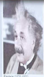
Einstein (1879-1955) physicist