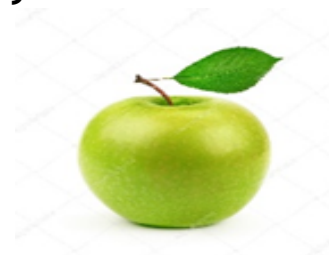
10. few apples