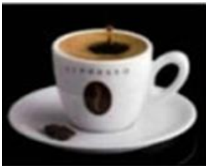
8. a little coffee