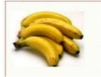
3. many bananas