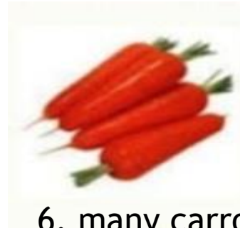
6. many carrots