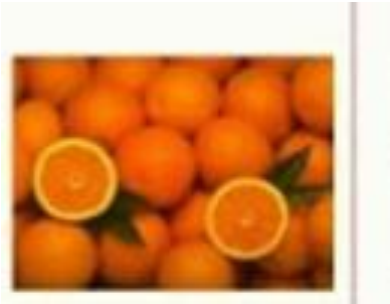
4. many oranges