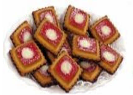
2. many cookies