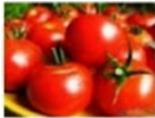
9. Many tomatoes