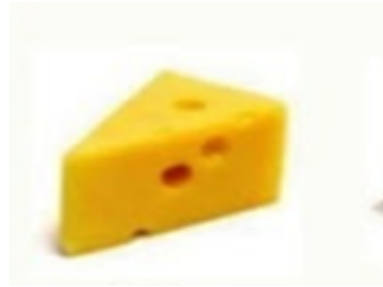
5. a little cheese