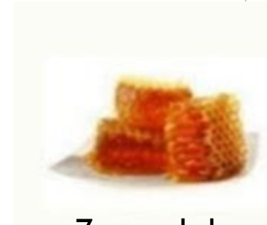
7. much honey