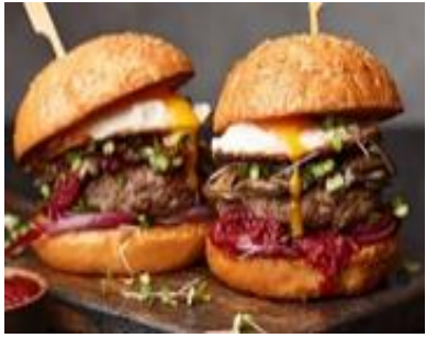
1. a few hamburgers